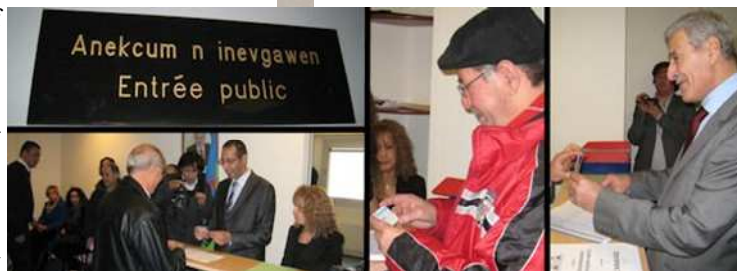
Issue of the first identity cards for Kabyls

which he qualified this date as historic. In the name of the Anavad, he urged all the Kabyls to get their identity card. « This card, he said, is our pride; it suggests other even more promising initiatives ». He added that « Today, we are among us, tomorrow, we will have our place among the nations » before concluding « long life to the Kabyls and long life to the Kabyl government ».