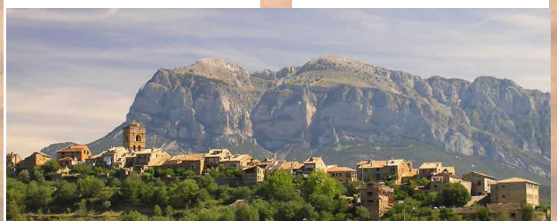
Aínsa (Spain, Aragon)